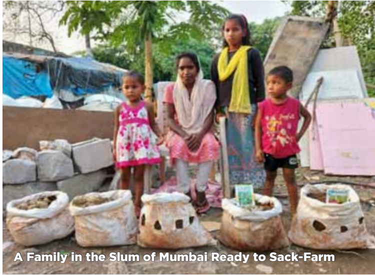
A Family in the Slum of Mumbai Ready to Sack-Farm

leaders have committed to overseeing the families for 12 months and afterwards each family is expected to continue on their own without close supervision.