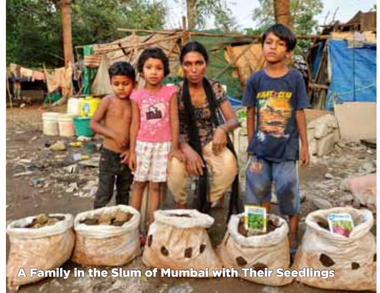
A Family in the Slum of Mumbai with Their Seedlings

Worldharvest would like to express our appreciation to all of our donors who have contributed towards this Sack-Farming project. Most importantly, we are grateful for