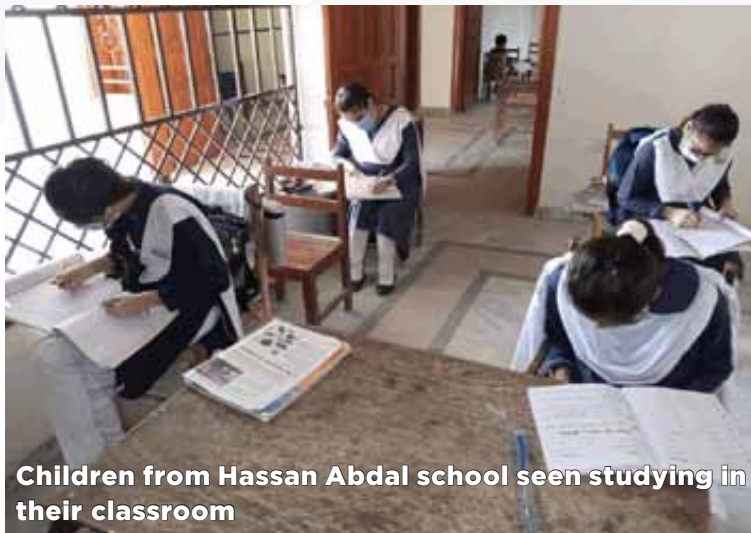
Children from Hassan Abdal school seen studying in their classroom

According to a UNESCO Report published in January 2020, the literacy rate in Pakistan stands at only 58%. An estimated 22.8 million children aged 5 to 16 are not attending school. In addition, 5 million children between the age of 5 to 9 year old are not enrolled in school. Literacy rates vary regionally, particularly by gender. But significant disparities also exist due to socio-economic status, religious beliefs, and geography.