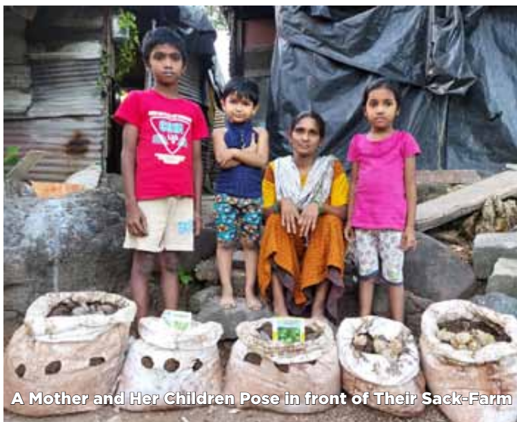
A Mother and Her Children Pose in front of Their Sack-Farm

to a near halt. In India, 12.2 million people have lost their jobs due to the lockdown to curb the coronavirus. In many third world countries, the pandemic affected the livelihoods of a huge number of people who found themselves without work, earning very little to sustain themselves and their families on a day to day basis. This grim reality calls for urgent interventions in the most innovative way in order to sustain their food supply while still conforming to government directives. Thus the idea of sack farming is introduced.