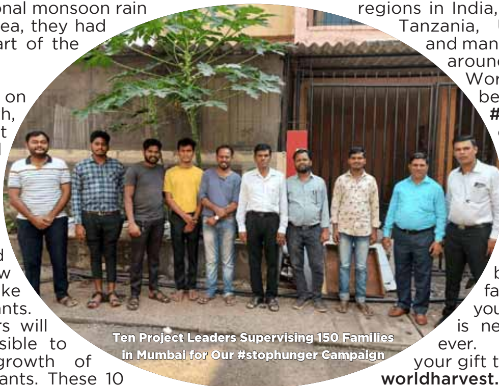
Ten Project Leaders Supervising 150 Families in Mumbai for Our #stophunger Campaign

Finally on October 11th, the project officially started and each of the 150 families was given 5 sacks complete with soil, manure, seedlings, and training on how to set up and take care of their plants. These 10 leaders will also be responsible to monitor the growth of each family's plants. These 10