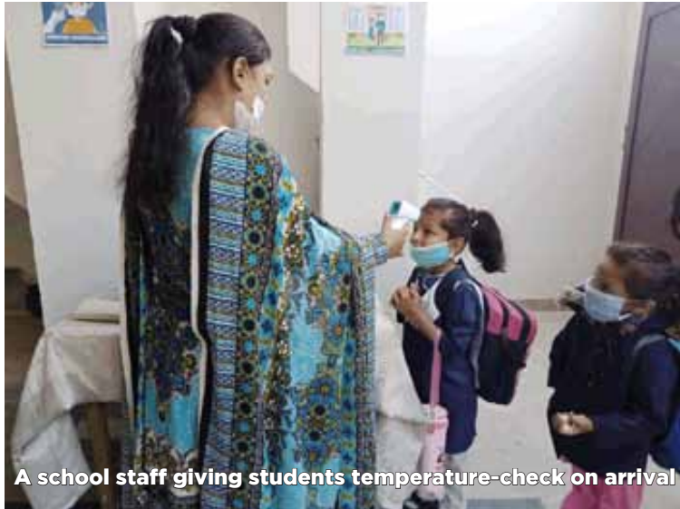
A school staff giving students temperature-check on arrival

had to be closed. Many families in Hassan Abdal have also lost their source of income. But through generous donors like you, WorldHarvest have been able to provide basic food supplies to these families. Through the Sponsor A Child (SAC) Program, children are still able to continue their education despite their families' current economic situation.