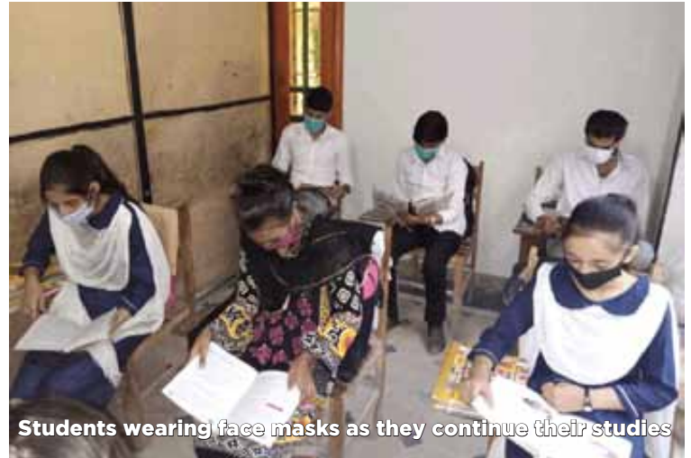
Students wearing face masks as they continue their studies