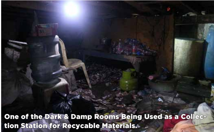
One of the Dark & Damp Rooms Being Used as a Collection Station for Recyclable Materials.

When the WorldHarvest Community Development team see the dire need of this family, they immediately put a plan in motion and inform donors of the opportunity to help. And thanks to the generous donors and friends of WorldHarvest like you, we have raised $6,000 toward the rebuilding of this house.