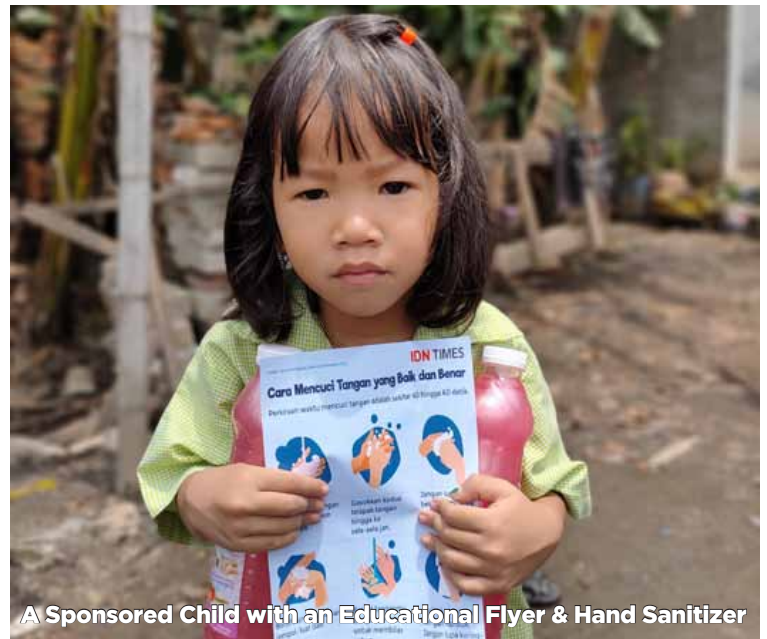
A Sponsored Child with an Educational Flyer & Hand Sanitizer protect themselves and others.

More in-depth topics such as differences between symptoms of the Coronavirus and regular Influenza are also taught. In addition, locations of the nearest health centers are given for each family. They are encouraged to immediately go to one of these centers if any of them develop symptoms of the virus in order to