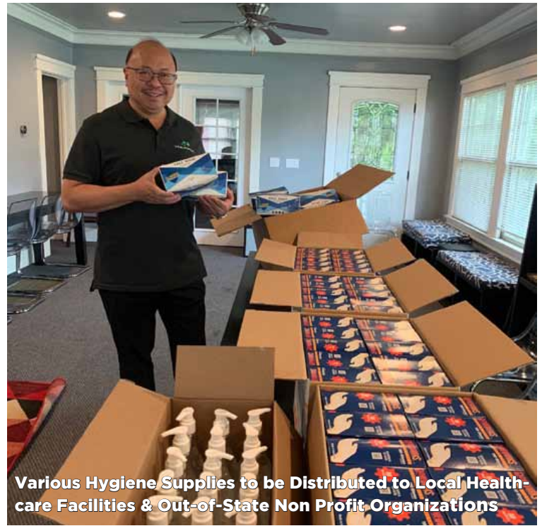
Various Hygiene Supplies to be Distributed to Local Health-care Facilities & Out-of-State Non Profit Organizations

the spread of this horrendous disease in our local community is only possible through the continued support of dedicated and generous WorldHarvest's donors like you. Our special thanks also goes to two of our corporate partners: Assignments International and Golden Nest who made it possible for us to distribute PPE supplies locally. To continue to provide care in both our local communities and to those worldwide, please consider donating to www.worldharvest.cc at this critical time.