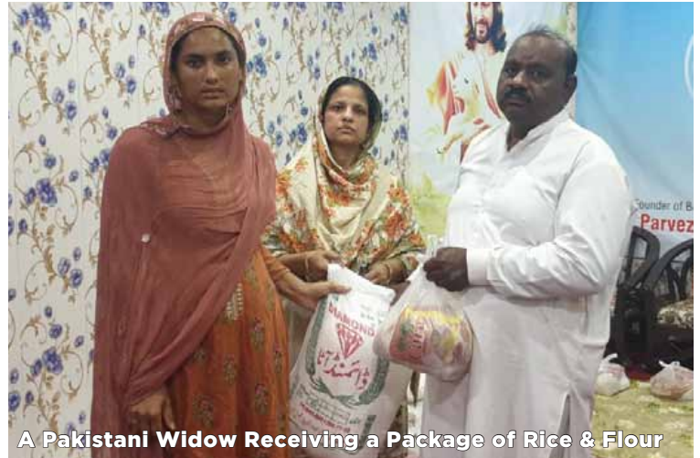
A Pakistani Widow Receiving a Package of Rice & Flour

society. Unfortunately, they bear the brunt of the crisis and their ability to subsist and afford basic necessities, such as food, housing, and clothes has been put at severe risk.