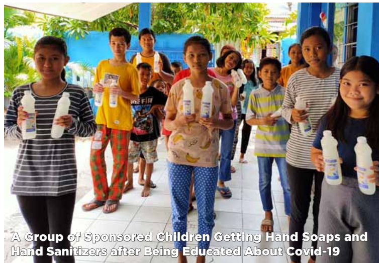
A Group of Sponsored Children Getting Hand Soaps and Hand Sanitizers after Being Educated About Covid-19

These educational sessions are conducted in an open-air setting, practicing social distancing. At the end of each session, hand soaps and hand sanitizers are distributed. Educational flyers showing how to properly wash hands are also distributed to over 1,500 sponsored children in 26 different communities.